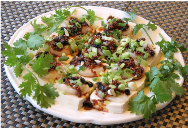
Steamed scallops & bean curd in black bean sauce

🕒 Dishes require longer preparation time and are not available after 8.00pm