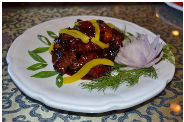
Qi'lin BBQ pork ribs

All dishes may contain traces of peanut 10% surcharge applies on public holidays Extra sauce $1.00 per serve Takeaway container $0.50 each NAG No added Gluten