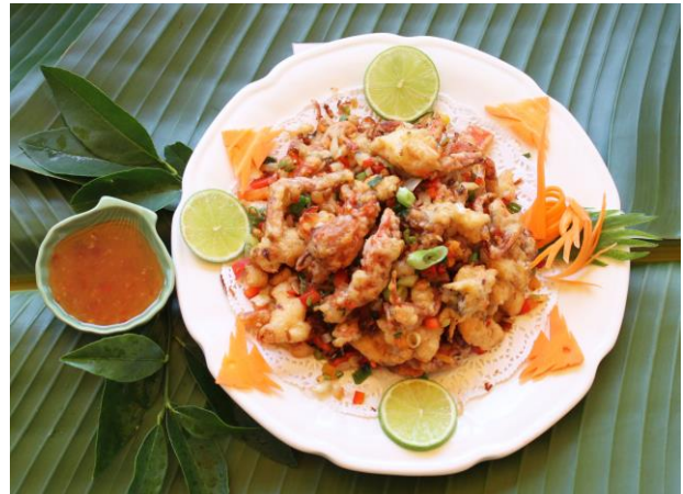
Deep fried soft shell crab with lime, ginger & sweet chilli sauce

All dishes may contain traces of peanut 10% surcharge applies on public holidays Extra sauce $1.00 per serve Takeaway container $0.50 each NAG No added Gluten