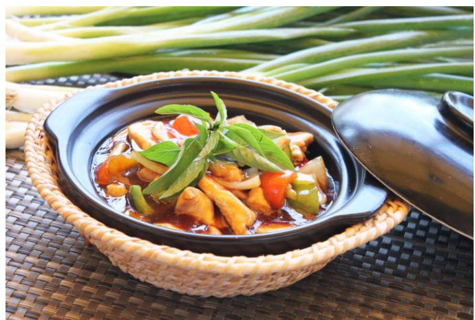
Taiwan style three cups chicken in hot pot

All dishes may contain traces of peanut 10% surcharge applies on public holidays Extra sauce $1.00 per serve Takeaway container $0.50 each NAG No added Gluten