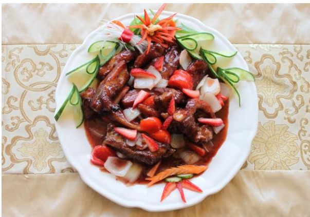
Pork ribs with strawberry liqueur sauce