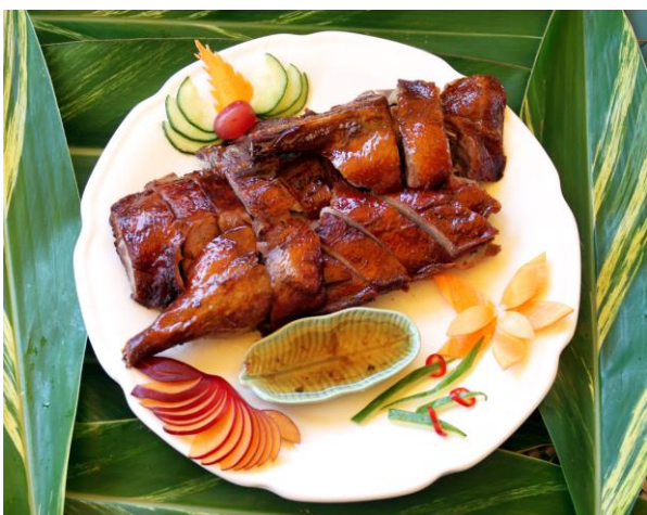
Hong Kong crispy skin roast duck

🕒 Dishes require longer preparation time and are not available after 8.00pm