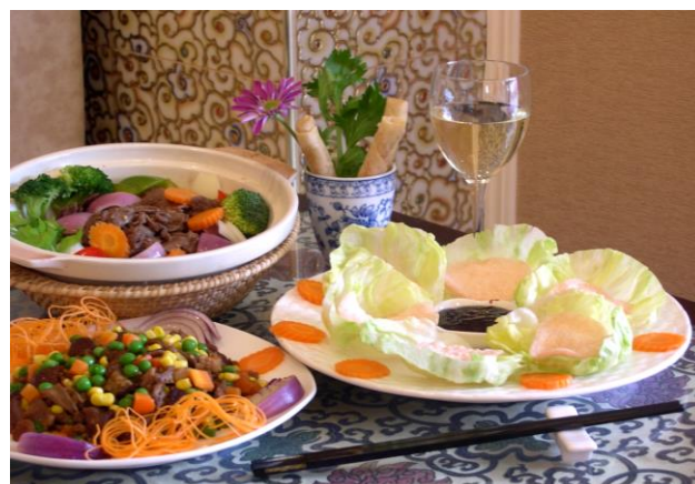
Duck meat san choy bow

All dishes may contain traces of peanut 10% surcharge applies on public holidays Extra sauce $1.00 per serve Takeaway container $0.50 each NAG No added Gluten